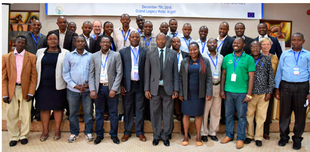
CDAIS group during the Validation Workshop