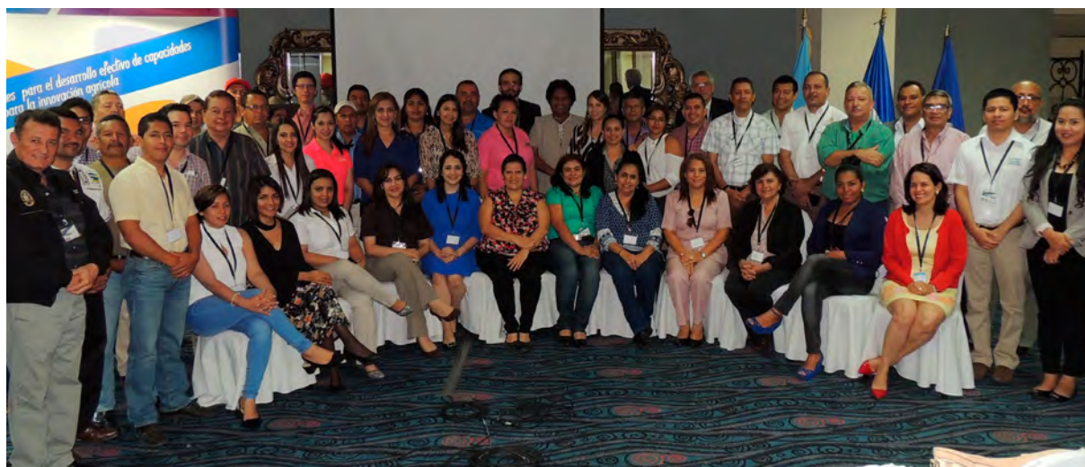
CDAIS group at Inception Workshop