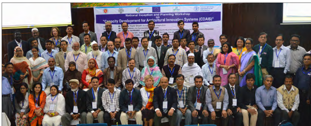
CDAIS inception workshop in Bangladesh.