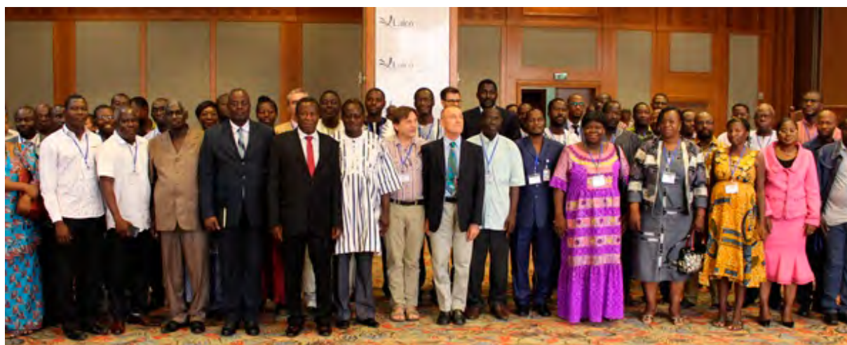
CDAIS group at the inception Workshop